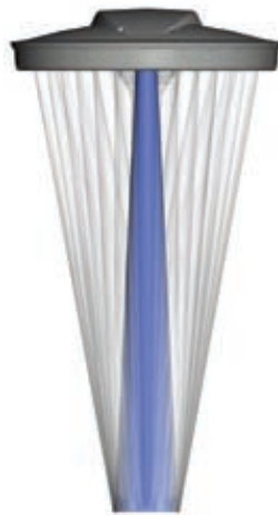
Figure 1. Each LED lens creates the entire pattern, so no matter how many you block, the spot remains clear and consistent.

The consistency of LED light means surgeons are not distracted by shadows moving across the pattern. In fact, some surgeons have commented that when using the LED lights, they no longer feel the need to wear their headlamps!