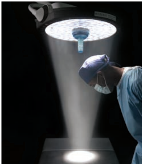
Figure 2. With LED lighting, distracting shadows created by the surgeon's head are virtually eliminated from the surgical field.

To determine how well a light renders deep, saturated red colors (the most critical color for surgical procedures) the lighting industry developed a special measurement, called the R9.